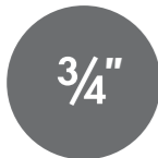
Curling Iron - Model CD10JBC